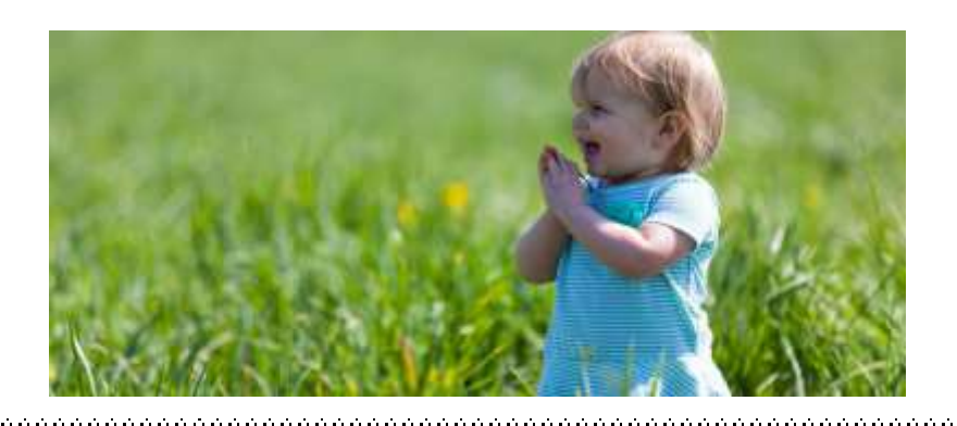
No child should go hungry. No child should be cold in their own home. No child should have to go without the essentials

If anyone would like a box for your loose change to help support children and families in need, please see Shirley Eade, or contact her on 01253 789217